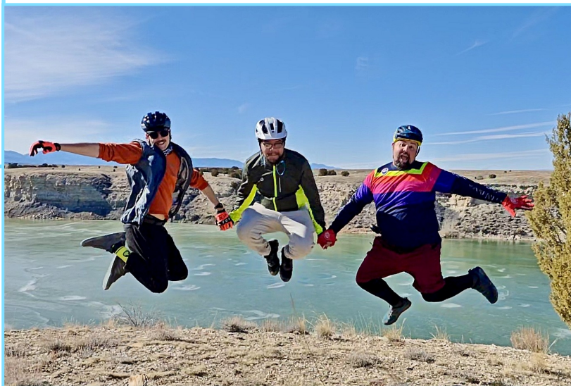
Pueblo Bike Riders enjoying a ride at the reservoir.