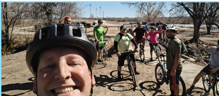
Pueblo Bike Riders enjoying the Arkansas River Trail.

This community ride celebrates the art, culture, and history of Pueblo during the no-drop Thursday evenings throughout the summer. They visit historic spots such as the Pioneer Cemetery on the northside, or ride along the Arkansas River Trail to view the Levee Art. They also plan tours to historic neighborhoods such as Bessemer and Mesa Junction. After the ride, riders enjoy a brew from Walter's Brewery.