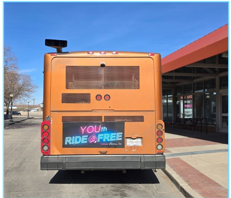
Bus tail advertisement for Pueblo Youth K-12 ride free.