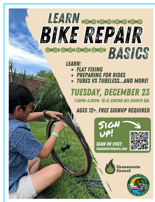
Flyer for bike repair class hosted by City Parks and Rec and Grassroots Gravel.