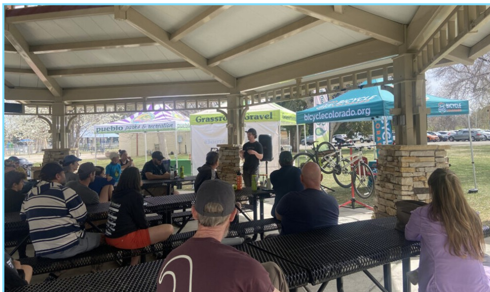
Roadside repair clinic held in March 2025 at City Park. Partners included City of Pueblo Parks and Recreation, Grassroots Gravel, Bicycle Colorado, and Great Divide.