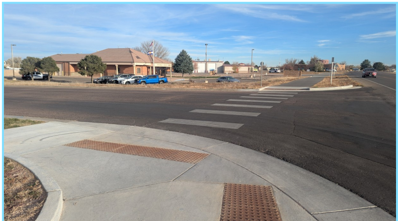
Joe Martinez Trail with new ADA curb ramps