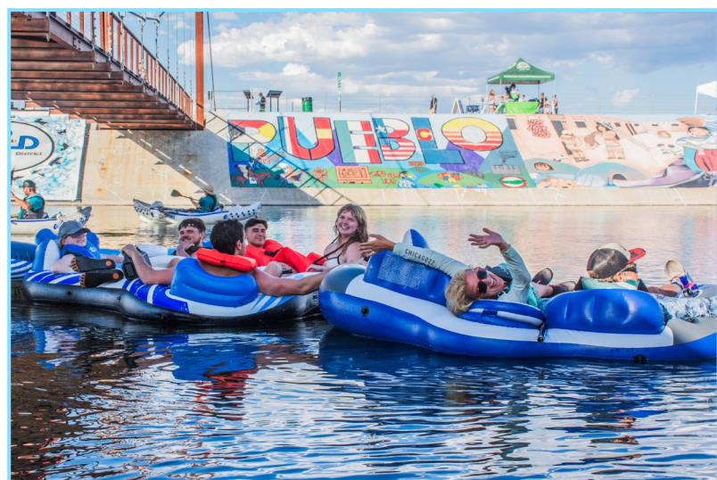
People tubing down the river during SCARF.