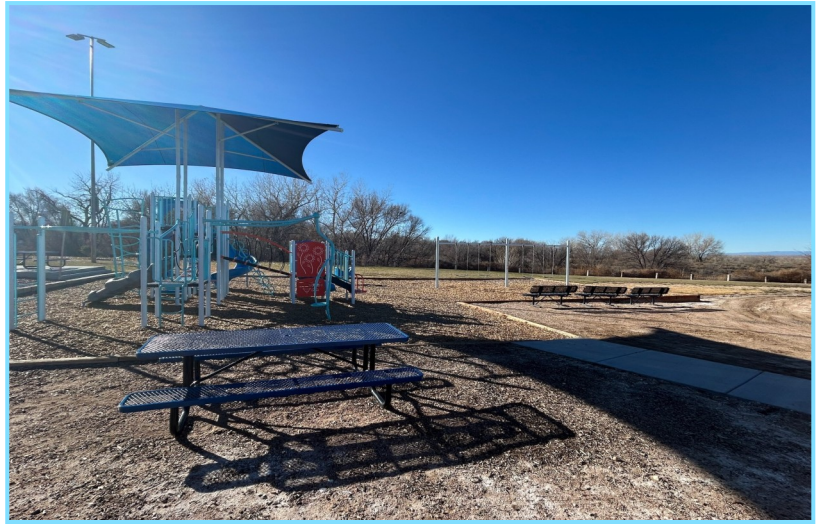
New playground at McHarg Community Center in Avondale