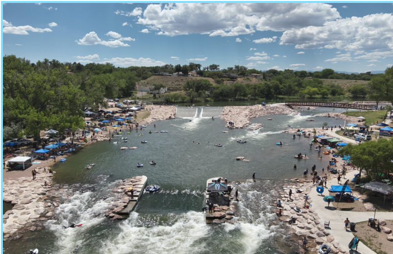
Waterworks Park during the first annual Steel City Arkansas River Festival (SCARF).