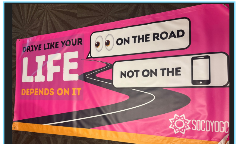
One of the banners that were used during CTC's Teen Safe Driving Campaign.