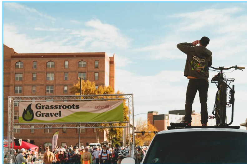
3rd Annual Grassroots Gravel Race.