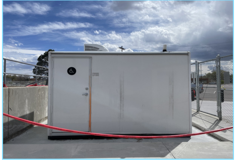
ADA accessible restroom at Dutch Clark Stadium