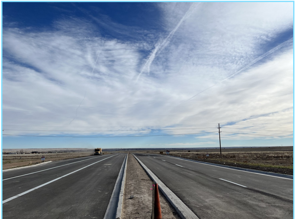
Medal of Honor Boulevard