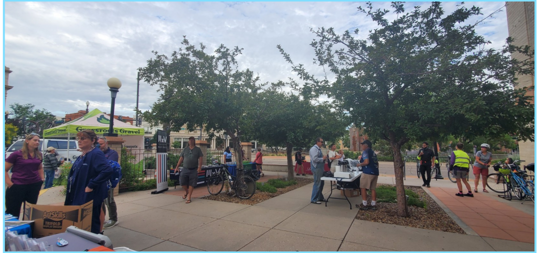
2025 Bike to Work Day!