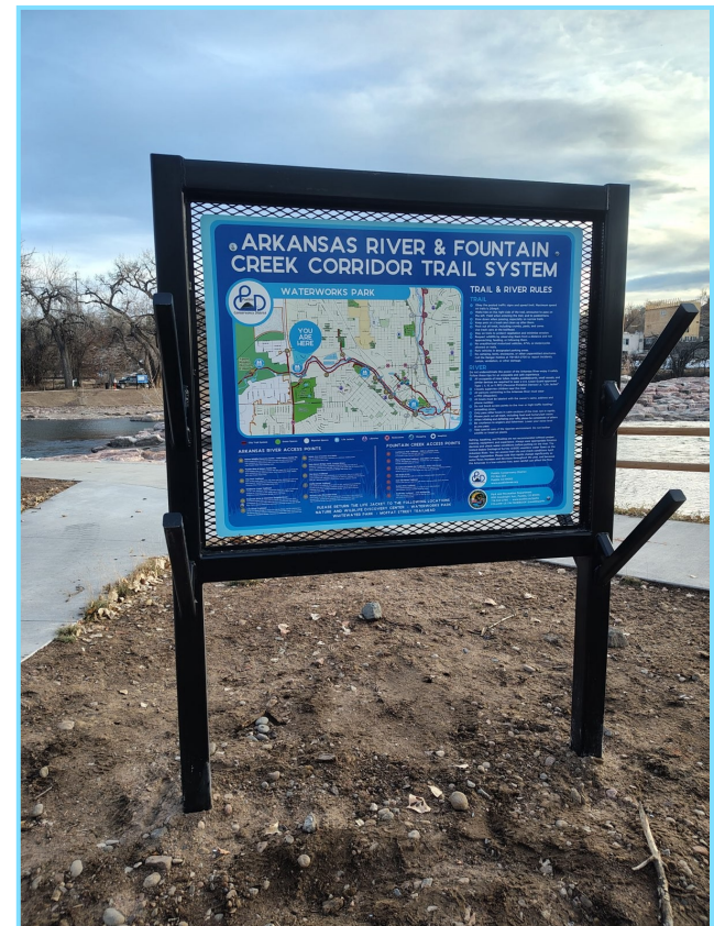
Life jacket loaner station on the northside of Waterworks Park.