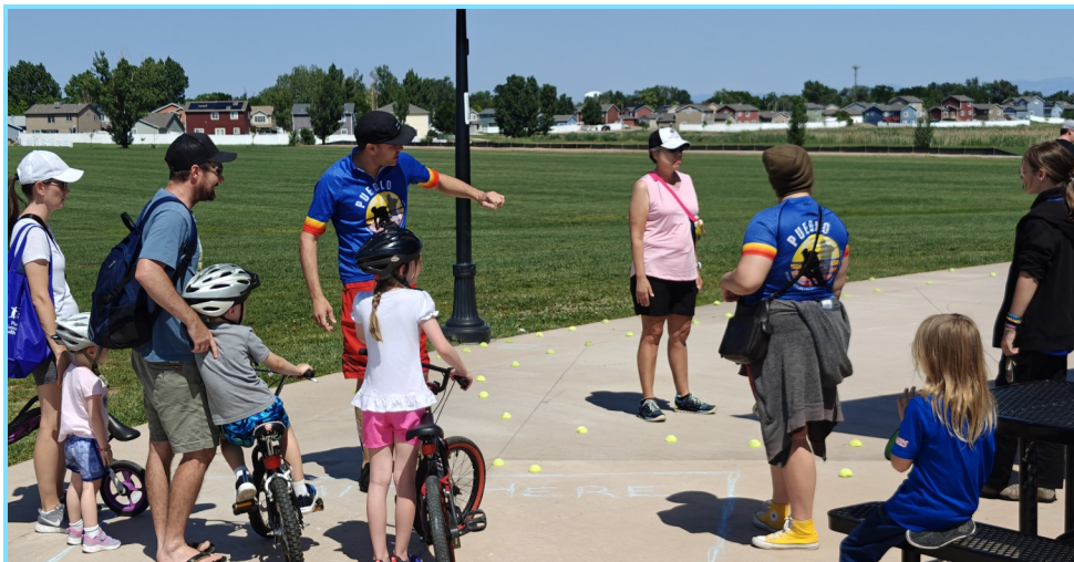
Volunteers teaching youth bicycle safety at Safety Jam 2025.