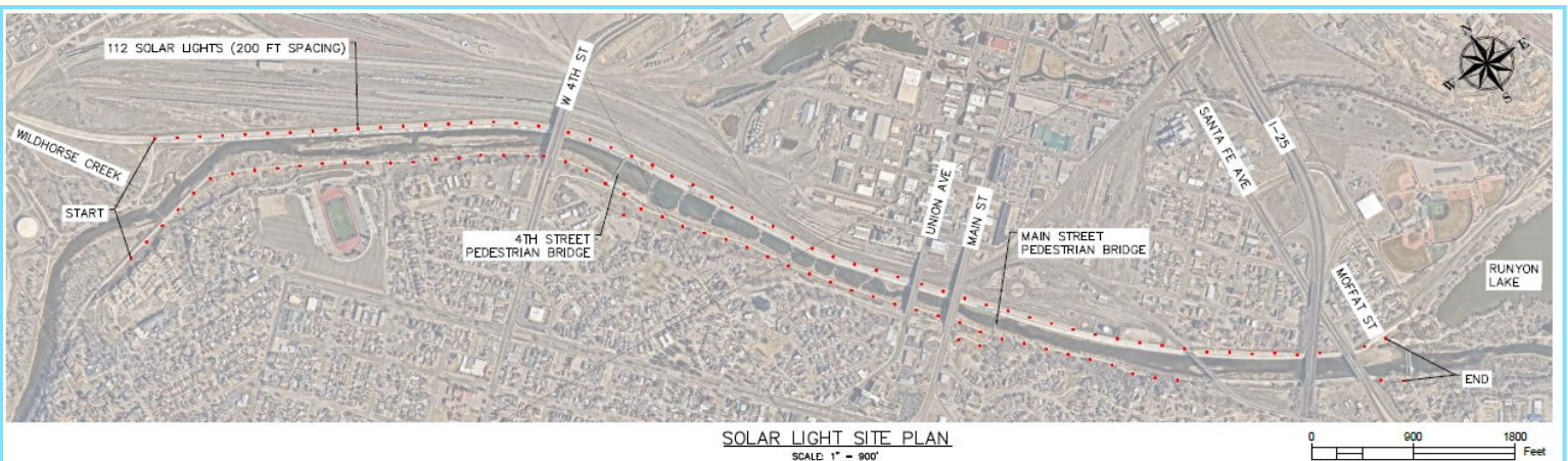
Solar light plan along the Arkansas River and Levee Trail from Wildhorse Creek Trail to Moffat Trailhead.