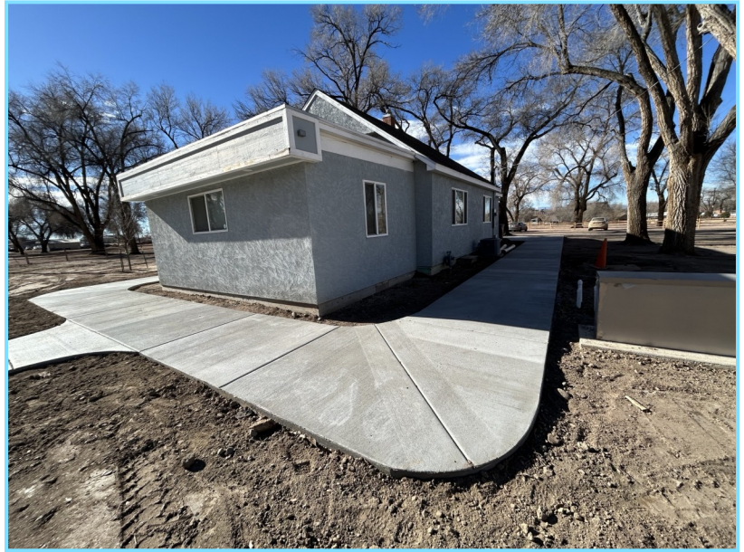
ADA access to Pueblo County Parks and Recreation office