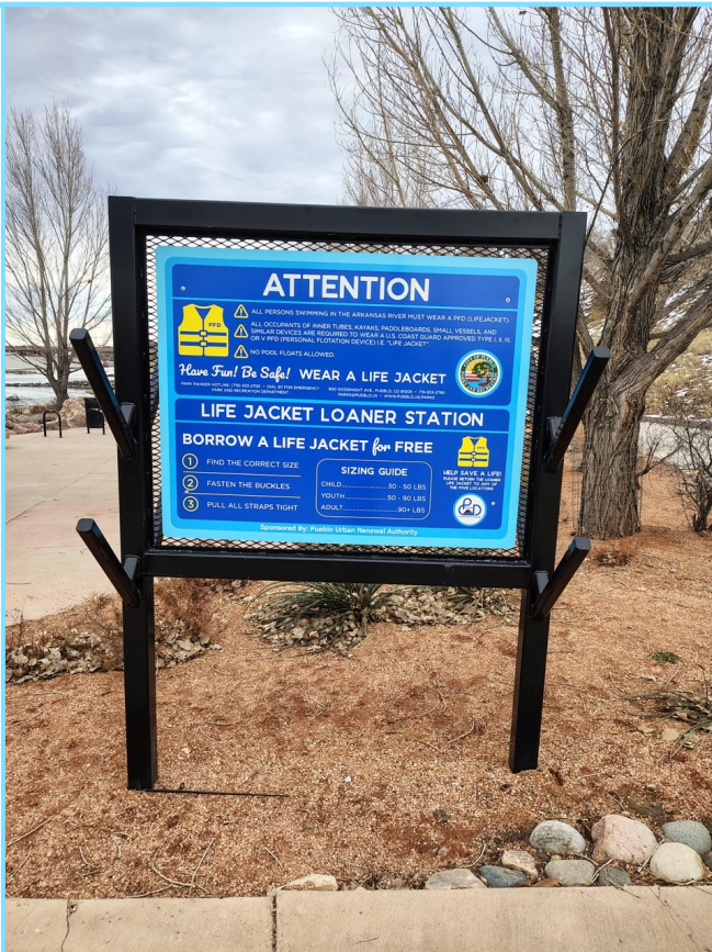
Pueblo Urban Renewal sponsored life jacket loaner station at Pillars Park