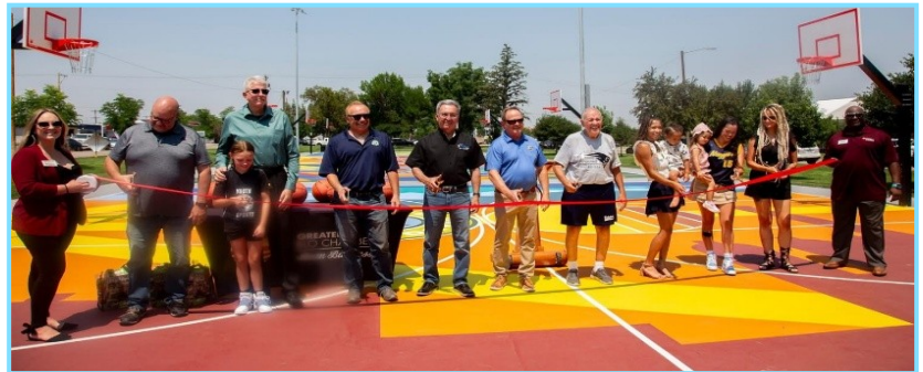
Ribbon cutting at the renovated outdoor basketball courts, "The Slab".

City of Pueblo's City Park and Arkansas River Corridor Master Plan will be adopted February 2026.