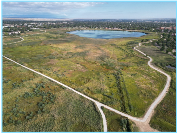
Lake Minnequa Trail System– also known as The Hobson Trail