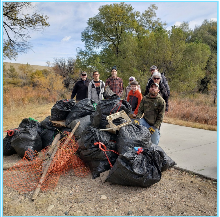
Volunteers with Pueblo Friends of the Arkansas River cleaned up Phelps Creek in November 2025.