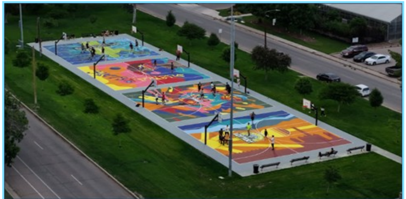
Birds eye view of the outdoor basketball facility, The Slab.