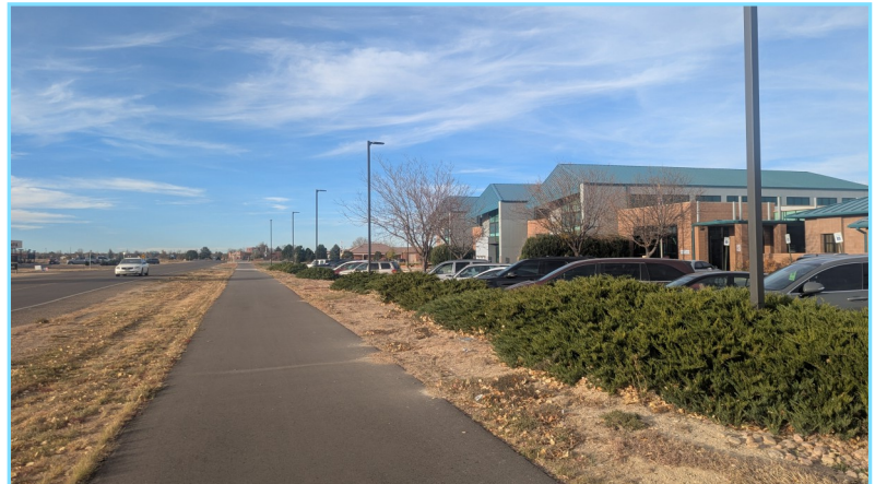
Joe Martinez Trail