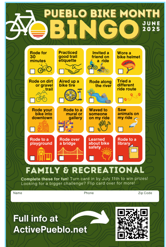
2025 Bike Month Bingo card