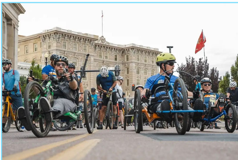
Adaptive Cyclers during the Grassroots Gravel 2025 race.