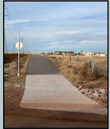
SDS Trail looking north from Industrial Blvd, Pueblo West Metro District project.