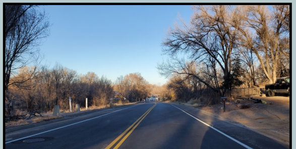
Roselawn Road, bike lanes, Pueblo County Public Works project.