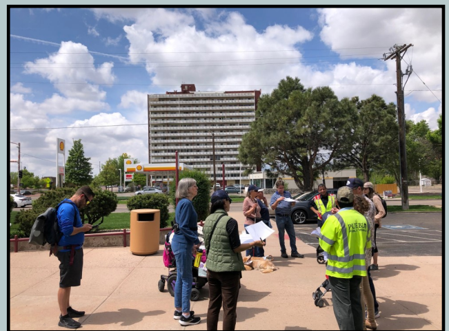
Bonforte Boulevard walk audit, Pueblo Area Council of Governments, Metropolitan Planning Organization Initiative.

If you have questions about these projects or would like more information please contact: