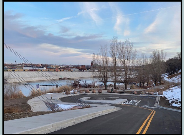
Rapids Place, City of Pueblo Project.