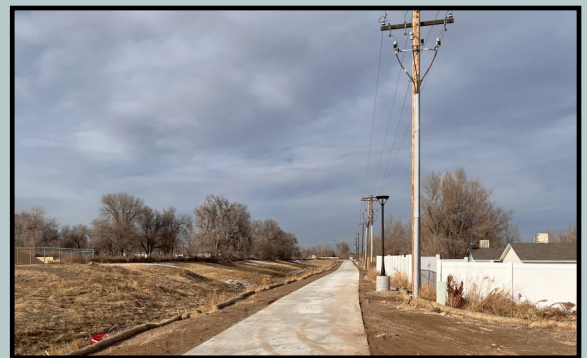
Lake Minnequa Connector Trail, City of Pueblo project.