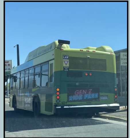
Pueblo Youth Ride Free, Pueblo Transit project.